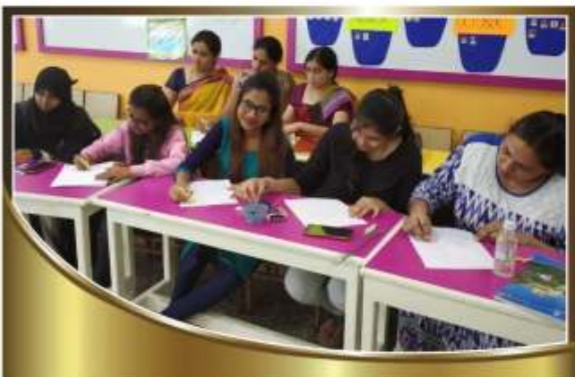
Students of Teacher Training Course engrossed in activity