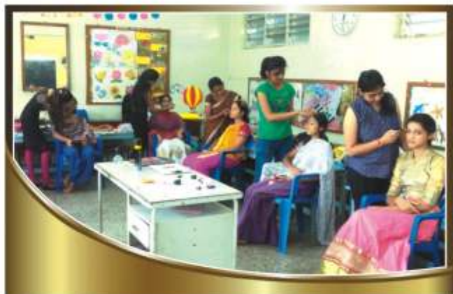
Grooming oneself through Beauty Parlour Course