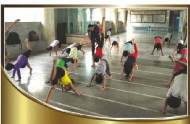
Children performing stunts at Gymnastic Class.