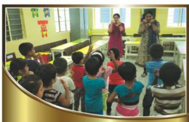
Little ones enjoying Phonic Class.