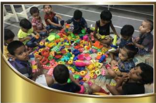
Children showcasing creativity through free play.