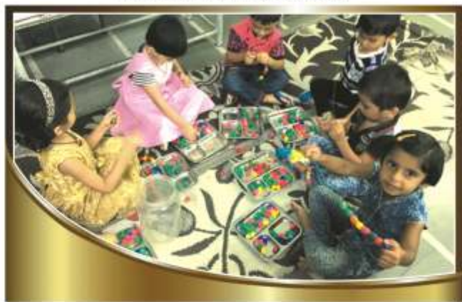
Beading activity is done with enthusiasm.