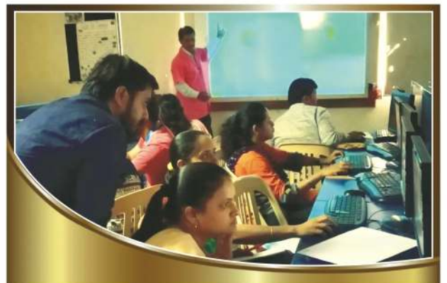
Teacher's attending training of SCRATCH for Compuskill Competition organised by Maharashtra Knowledge Corp. Limited.