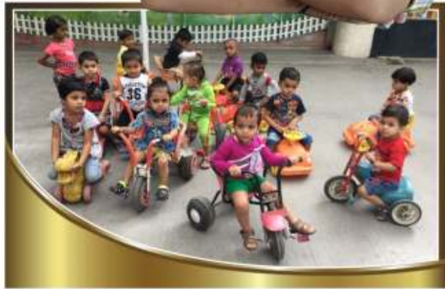
Children enjoying cycling.