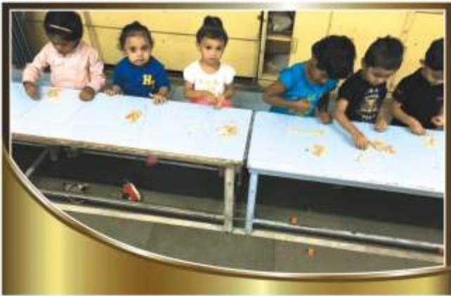
Children engrossed in Pistachio Shell Activity.