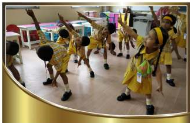
Tiny tots dancing to the rhythm of music.