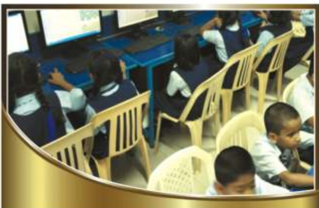
Children getting techno-savvy through Computer Classes.