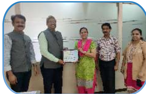
Interact Club of ASVVS received Certificate of Appreciation from Rotary Club of Poona Midtown for the activities conducted throughout the year.