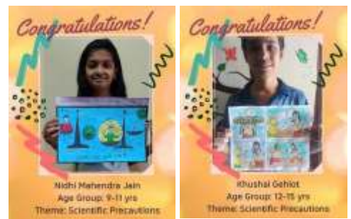
Prize Winners of National level Drawing competition conducted by Persistent Foundation and i4C.