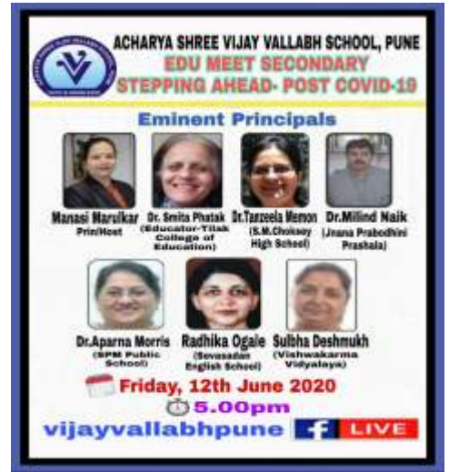
'Stepping Ahead - Post Covid 19' Webinar was organised of Eminent School Principals