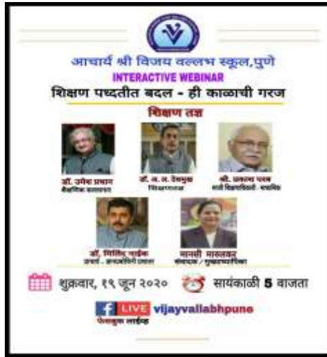
'Change in Education - Need of the Hour' Webinar was organised of Eminent Educationists.