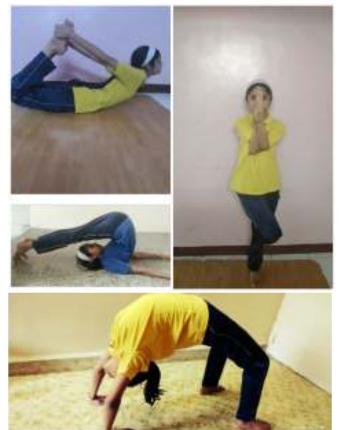
Students performing various Asanas