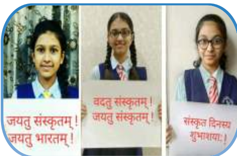
Students performing various Sanskrit Activities on the occasion of Sanskrit Day.