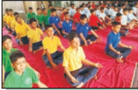
Students performing different asanas on International Yoga Day.