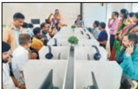
The Ex-students of Batch 1994-95 had a wonderful get together at school cherishing their school days