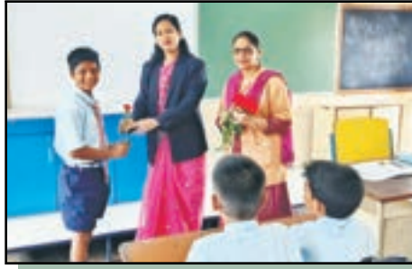
The Principal and class teacher welcoming the students of Std V to the Secondary section for the new Academic Year 2023-24.