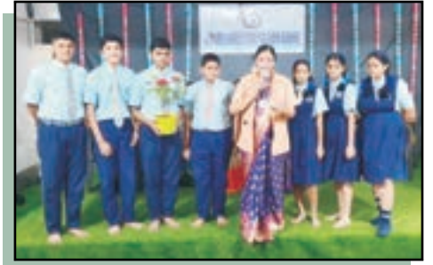
Celebrating this auspicious day with a difference by taking an oath and adopting the students of Std X by the Principal and teachers of Std. X.