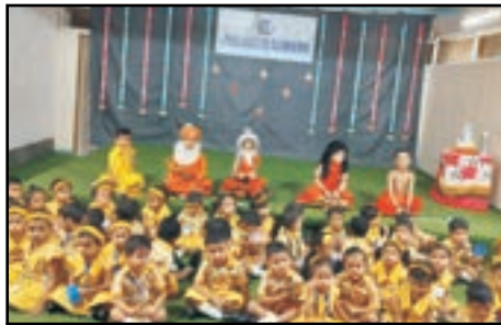
Students nurturing their soul by offering gratitude towards the Gurus.