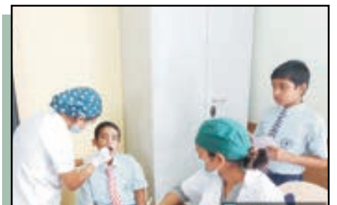
The school had conducted a dental check up from 31st July '23 to 4th August '23 as the health of the students is a matter of priority along with academics.