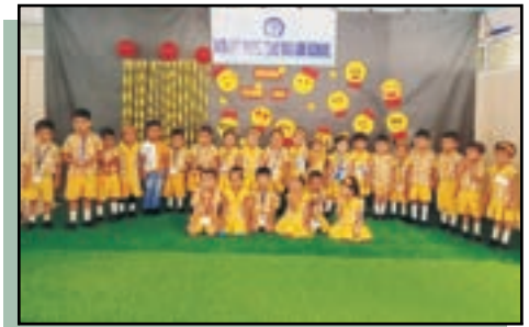
Teaching students the expression of feelings through various emojis.