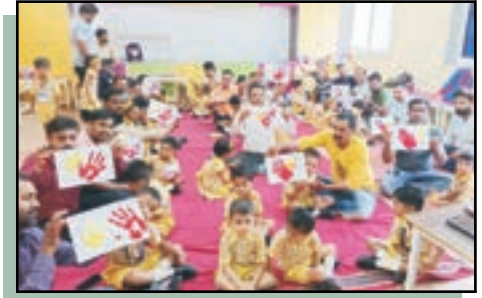
Children spending fun time with their first role model.