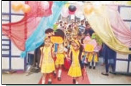
Happy faces coming to school with great enthusiasm.