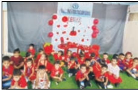
Concept of red colour was introduced for Nursery and Playgroup students by celebrating Red Day.