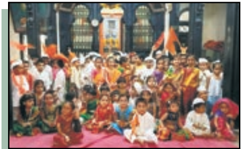
Students enjoying the palki procession at Shree Datta Mandir.