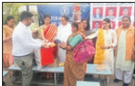
The management, staff, students and ex students of the school distributed utilities to the warkaris.