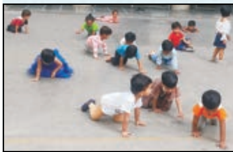
Students enjoying their outdoor play.

Balbhavan is an evening recreational center which caters to the physical, social and cultural needs of the children. Balbhavan is a place for magical childhood enriched by varied experiences, new discoveries and warmth.