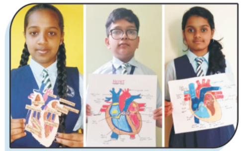
Students made various Models of Science.