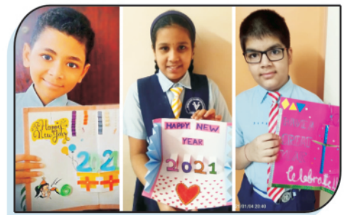
Students made New Year Greeting Cards and showcased their artistic talent.