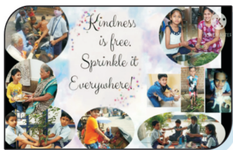
Small actions make a bigger difference, so here is an activity conducted virtually on value based education showing different ACTS OF KINDNESS.