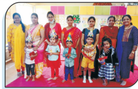
Proud mom and child winners of the event.