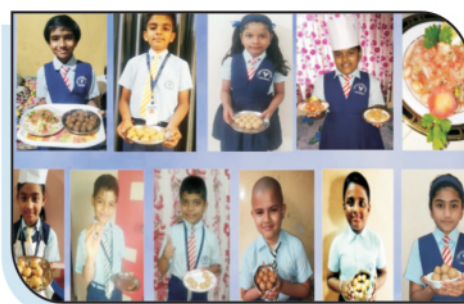
Our students made peanut ladoos and salads practically. Through these activities children not only feel important, helpful but also responsible. Thus "Self Help is The Best Help".