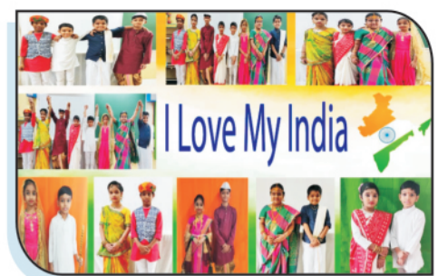
Students spread the message of National Integration. It is a feeling of unity, peace and spreading brotherhood in the midst of fellow Indians.