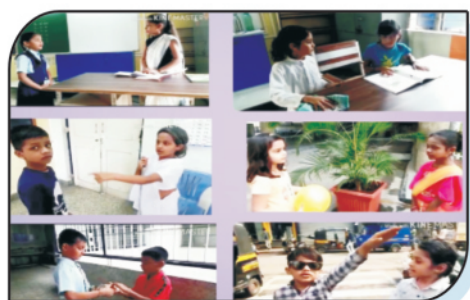
Everybody deserves respect regardless of their gender, race or their beliefs. Thus value based activity was conducted by our students.