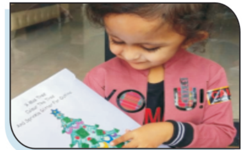
Kartik Choudhary of Nursery B decorated the Christmas tree.