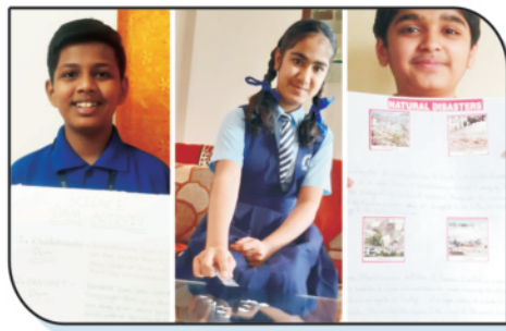
Students performed various Science Activities.