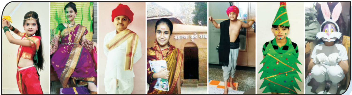
Fancy Dress activity was conducted for the students of std. V and VI on the occasion of Savitribai Phule Jayanti.