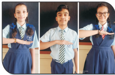
Students took oath on the occasion of Constitution Day.