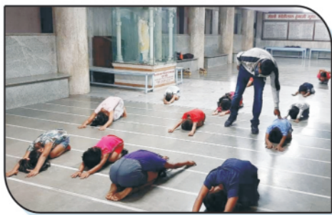
Hard core exercise to build up physical strength.

Taekwondo is not just kicks and punches but also self-discipline and perseverance.