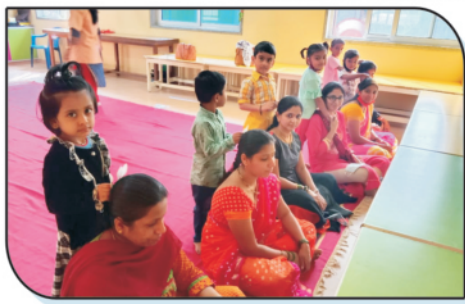
Fun to win when Mom is with me, hair grooming by tiny stylist.

Working along with mom is not just fun but also a bond that strengthens love and understanding among each other.