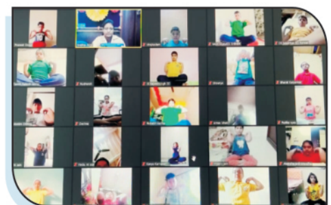
Meditation is known to enhance the flow of constructive thoughts and positive emotions thus Meditation and Yoga exercises were conducted to refresh the students.