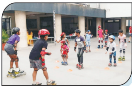
Tiny skaters ready to move.

An outdoor activity which enables you to balance your moves and develop your Physical strength.