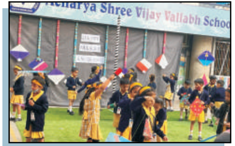
Children flying colourful and decorative kites to mark the occasion of Makar Sankranti