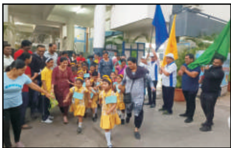
Students were given a wonderful opportunity to run and win for marathon