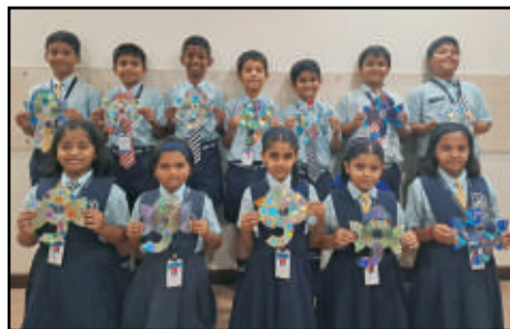
Ganpati Idols made out of recyclable CDs by the students of std.IV