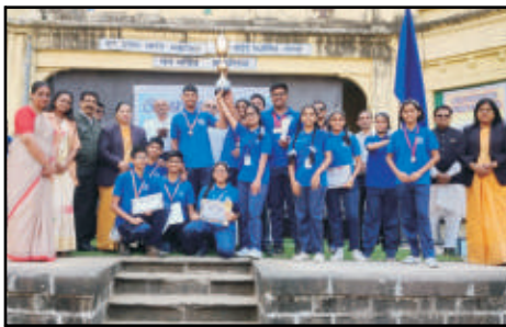
Samudra House of Secondary School was declared as the 'Winner House 2022'