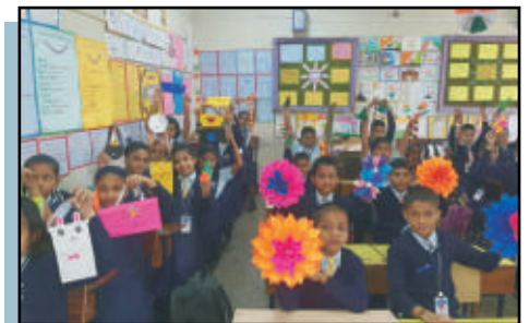
Creative and attractive handmade items made by students of std.IV