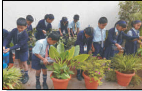
Students engrossed in taking care of the potted plants