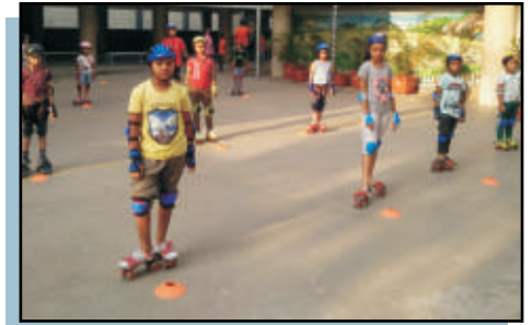
Students all set for Skating