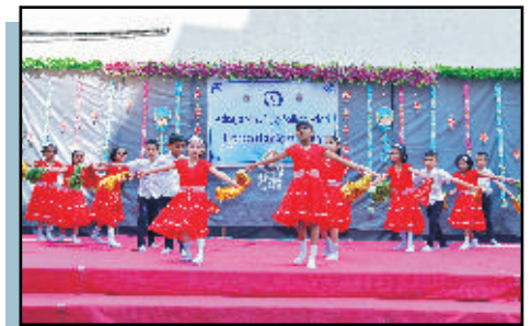
Primary students performing a dance