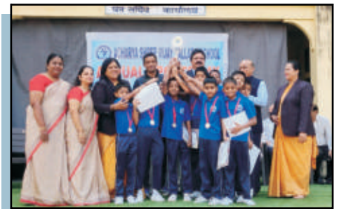
Samudra House of Primary School was declared as the 'Winner House 2022'