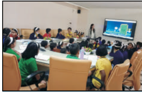
Children engrossed in updating oneself through Internet workshop