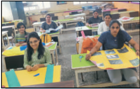
Teachers to be ' busy preparing creative activities

The courses conducted under IECD : Early Child Care and Education (Pre- Primary Teachers Training Course), Basic and Advance Computer Courses, Spoken English Course, German Language Course, Phonics, Abacus and Beauty Parlour Course, Dance, Tally, Yoga, Skating, Gymnastic, Taekwondo, Volleyball & Workshops.