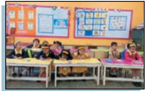
Students of Sr.Kg exploring their writing skills