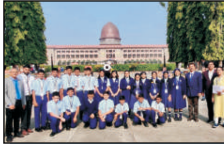
To witness the NDA Passing Out Parade, Rotary Club of Poona Midtown invited students of std.VIII