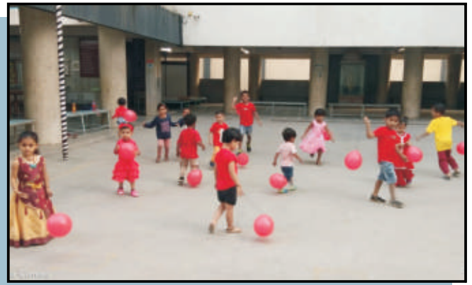
Tiny tots chasing and playing with the red balloons

An evening activity is a great way for kids to take a break from academics and release the pent up energy. It also helps them lead fuller and happier lives as regular sports and fitness activities have proven to provide not only physical benefits but also social and psychological benefits to children.