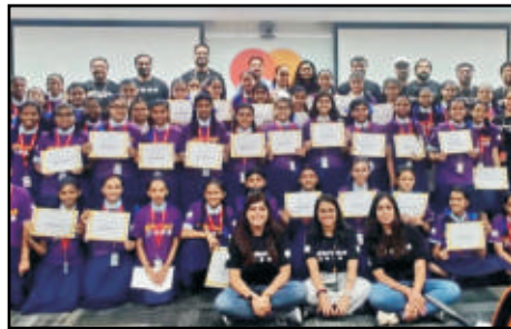
'Girls 4 Tech' session inquired based activities through STEM principles conducted by Mastercard for girls of std. VIII