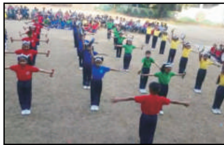
Students performing drill on Prize Distribution Day