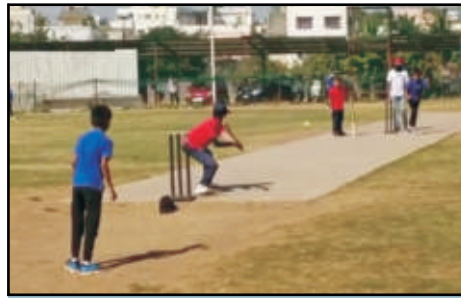
Students of Samudra and Indra House playing their final Cricket match