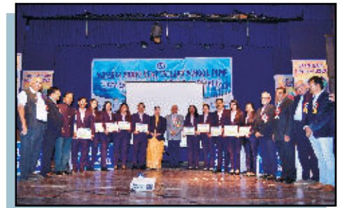
Core Team members of Compuskills 2022 are being felicitated