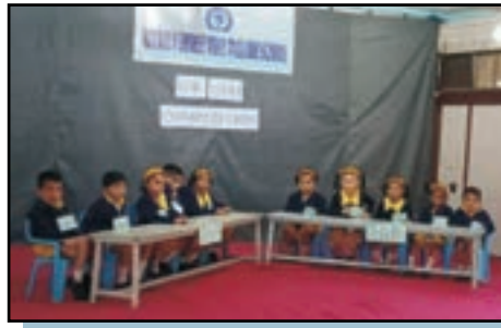
Jr.Kg students unlocking the knowledge at the speed of thoughts during Quiz Competition