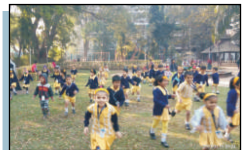
Cheerful faces exploring their happiness in an open field