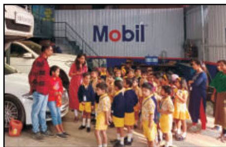
Power Solution – Children were given information on different parts of vehicles as a part of experiential learning