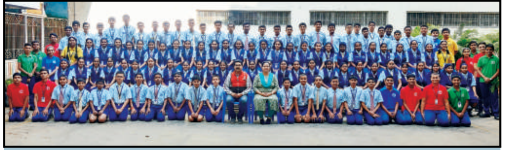
Participating students of Elementary and Intermediate Drawing Grade Examination 2022 conducted by Directorate of Maharashtra State