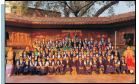
On the occasion of the Birth Anniversary of Savitribai Phule, the Lady Social Reformer in Girls Education, girls of std. VIII and IX visited Mahatma Phule Wada