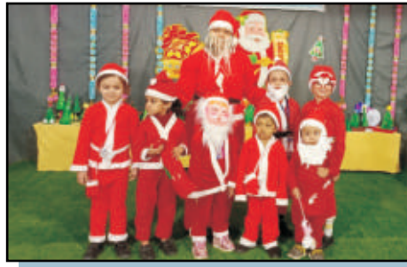
Fervour of Christmas all set with tiny Santas