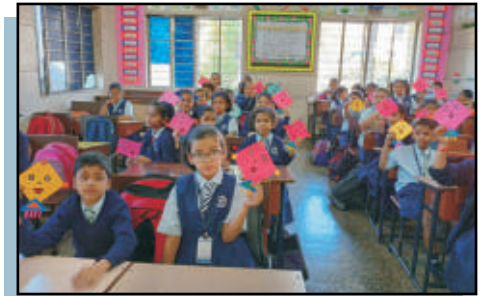
Colourful kites made by students of std.II on the occasion of Makar Sankranti