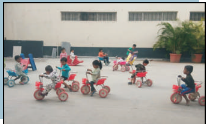
Children paving their way out through cycling